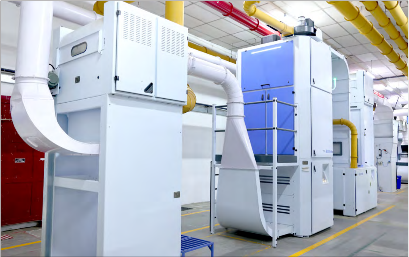
Trutzschler blowroom machines and Contamination detector