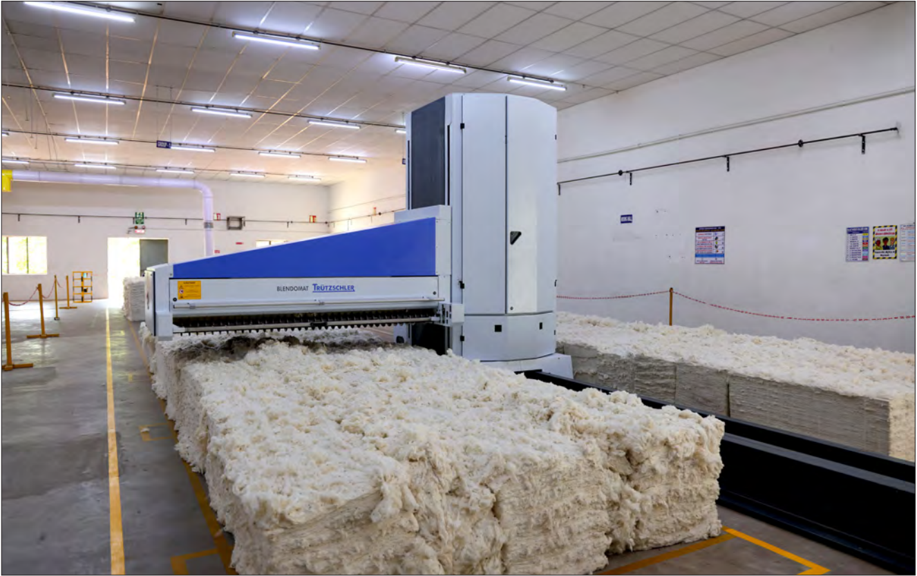
Automatic Bale opener installed in blowroom