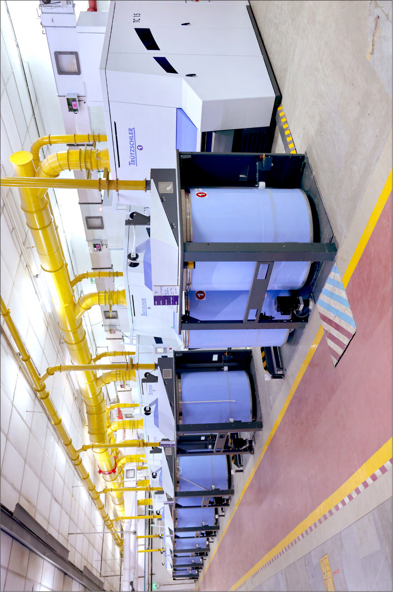
Trutzschler TC 15 model Carding Machine