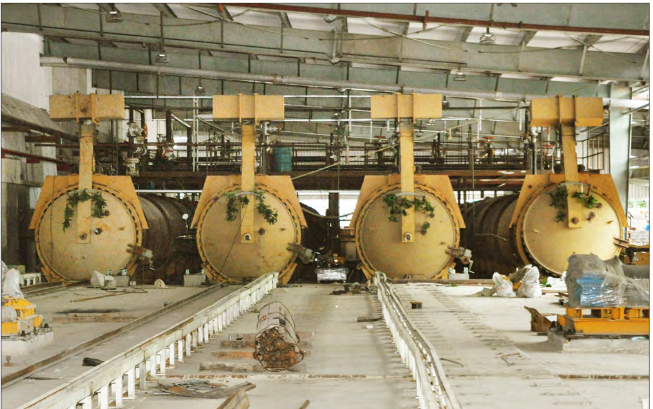
Arakkonam Unit Line 2 - Autoclaves