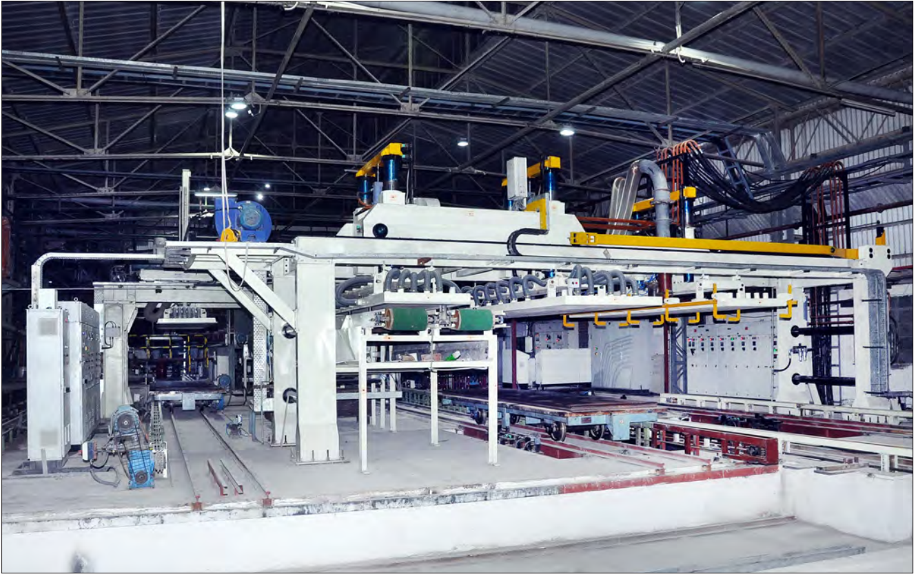
Arakkonam Unit Line 2 - Destacker & Template Piler